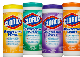
Clorox® Disinfecting Wipes 35 Count

Fresh Scent Case UPC: 31428 2/700 ct., size 7" x 7" For buckets, please see your broker.