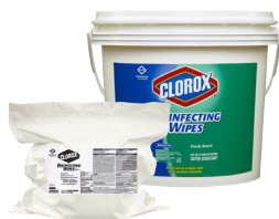
Clorox Commercial Solutions® Clorox® Disinfecting Wipes 700 Count

Fresh Scent Case UPC: 15949 6/75 ct. Lemon Scent Case UPC: 15948 6/75 ct.