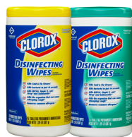
Clorox Commercial Solutions® Clorox® Disinfecting Wipes 75 Count

Fresh Scent Case UPC: 15949 6/75 ct. Lemon Scent Case UPC: 15948 6/75 ct.